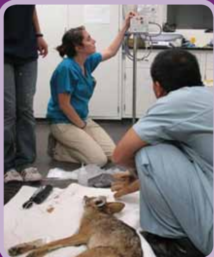
Coyote pup receives first class care